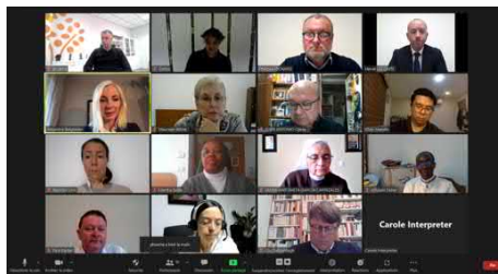
OIEC Board of Directors November 18, 2021